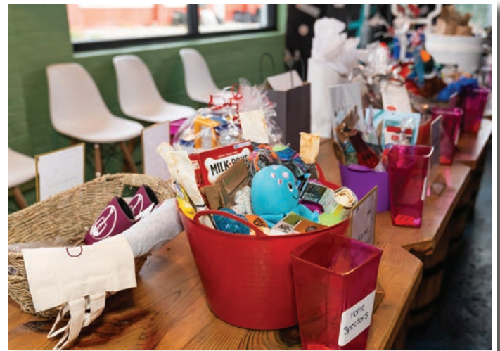
Some of the baskets raffled off at the event.