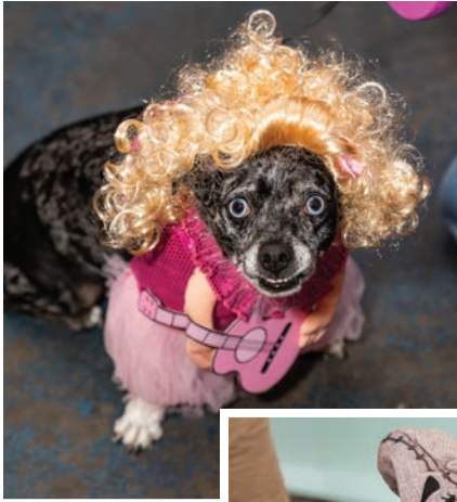
Some of the costumed critters at the Pet Paw-ty.