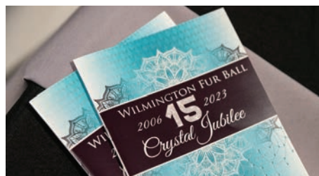
Fur Ball